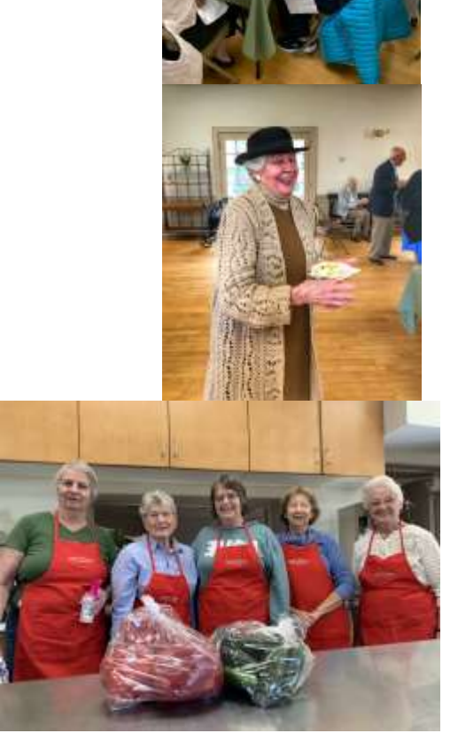
Promote and Support the Arts