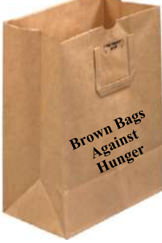
Feed the Hungry